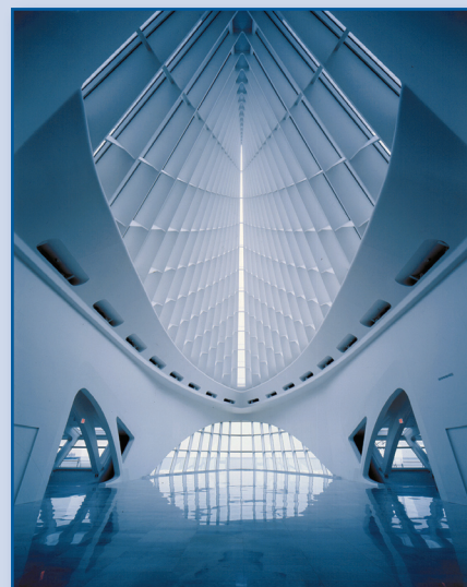
Milwaukee Art Museum.

There are 98 parking spots underneath the Museum. A voucher will be given to attendees who park in this lot. There is also a parking structure across the street from the Museum.