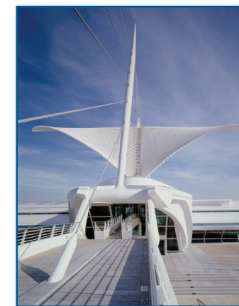
Milwaukee Art Museum.