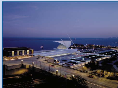
Milwaukee Art Museum.

May 4, 2001, marked the initial unveiling of the Milwaukee Art Museum's new expansion and renovation which combines art, dramatic architecture and landscape design. Our new Quadracci Pavilion, the first Santiago Calatrava-designed building in the United States, features a 90-foot high glass-walled reception hall enclosed by the Burke Brise Soleil, a sunscreen that can be raised or lowered creating a unique moving sculpture. Visit www.mam.org for the latest information on hours and exhibits.